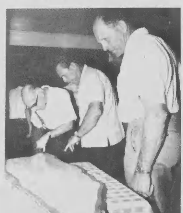
Admiring the gift